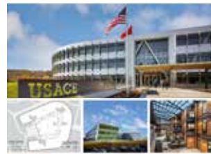
Federal Center South Building 1202 design-build team