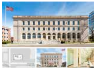
Wayne N. Aspinall Federal Building & U.S. Courthouse design-build team with integrated firms